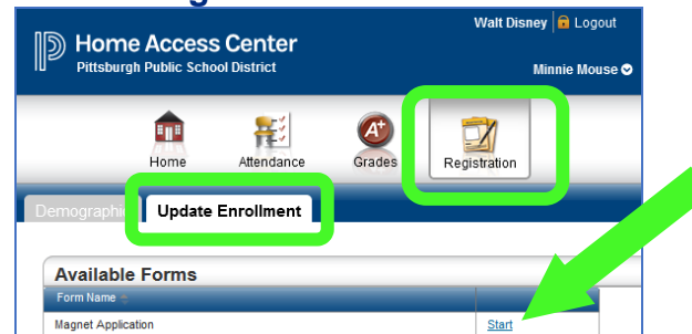
Step 4: Complete the application!

Step 3: Click on the registration screen, then the 'update enrollment' tab to access the magnet application form. Click 'start' next to the Magnet Application to begin.